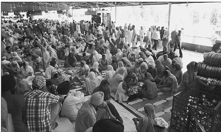
A scene from the 16-minute documentary "Holy Kitchens: True Business," which will have its world premiere at the Sikh International Film Festival in New York Oct. 22.

For more information, visit the Sikh Art and Film Foundation online at www.sikharts.com .